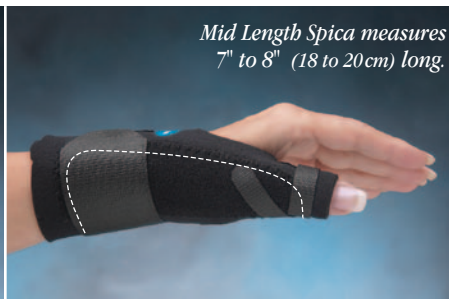
Mid Length Spica measures 7" to 8" (18 to 20cm) long.