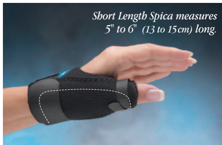
Short Length Spica measures 5" to 6" (13 to 15cm) long.