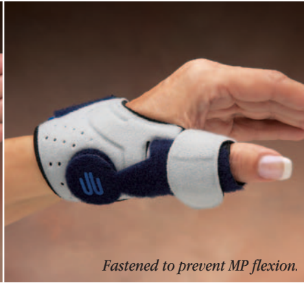
Fastened to prevent MP flexion.