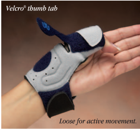
Loose for active movement.