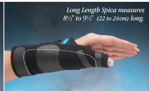
Long Length Spica measures 8 1/2" to 9 1/2" (22 to 24cm) long.