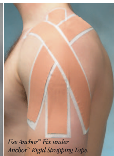
Use Anchor™ Fix under Anchor™ Rigid Strapping Tape.