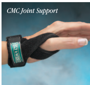
CMC Joint Support