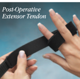
Post-Operative Extensor Tendon