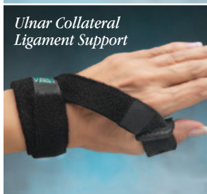
Ulnar Collateral Ligament Support