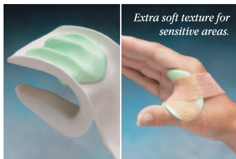
Extra soft texture for sensitive areas.