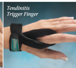
Tendinitis Trigger Finger